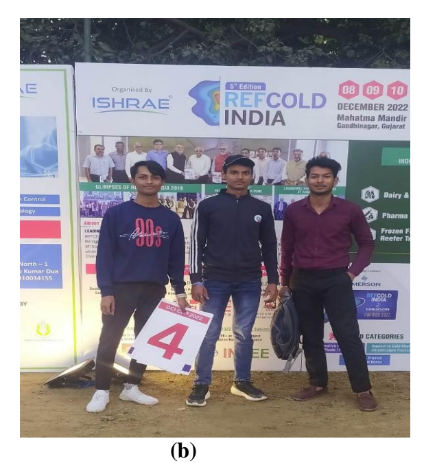
Figure: Shows the presence of students at the events