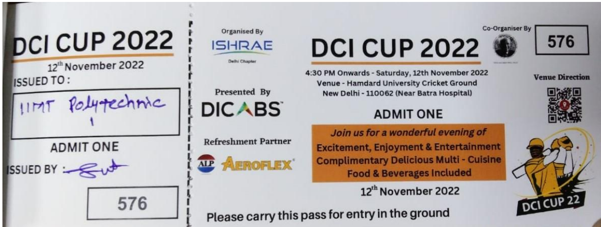
Figure: Shows the Pass of the Event

Figure: Shows the presence of students at the events