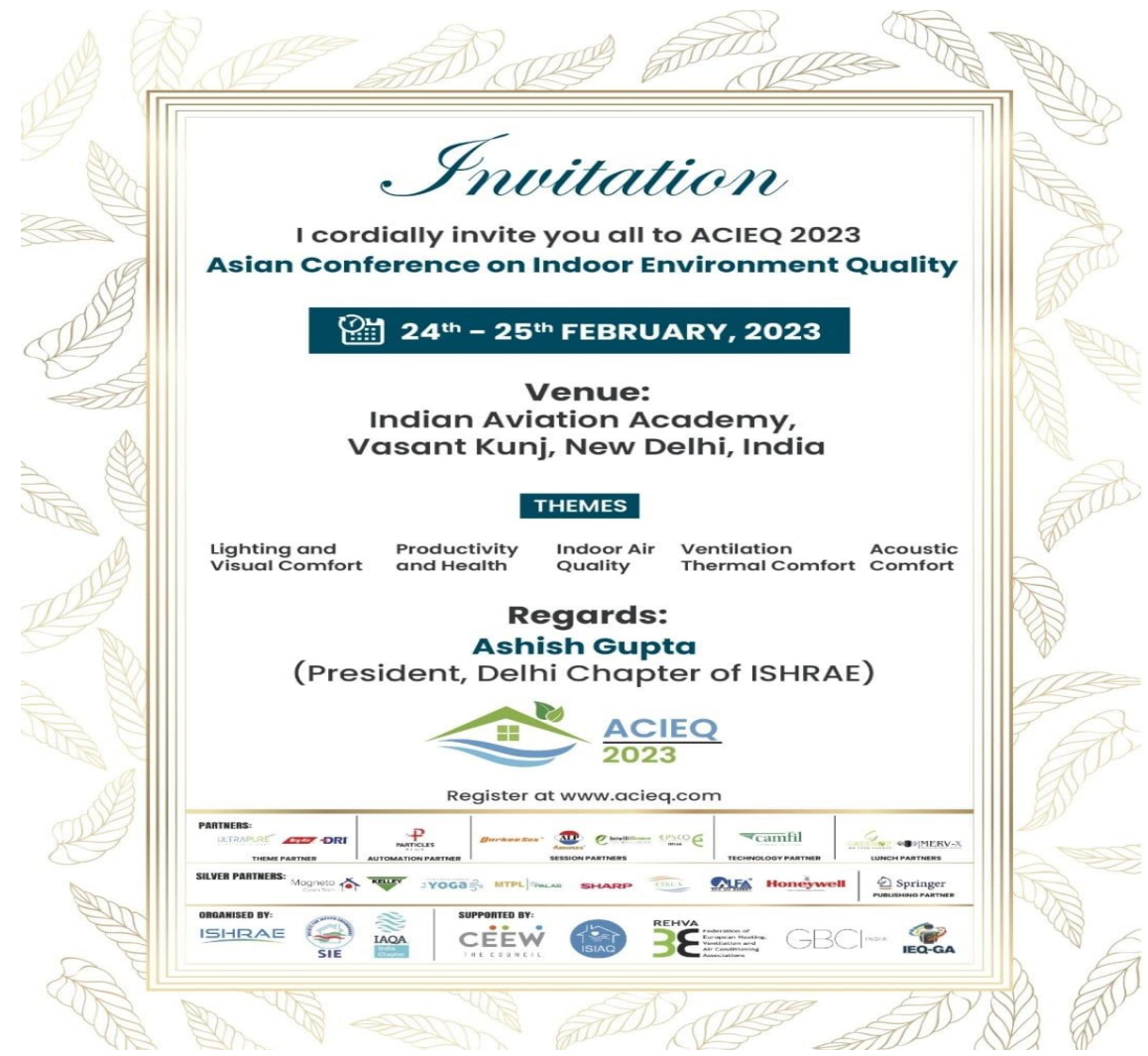
Figure: Invitation from the Ishrae Society