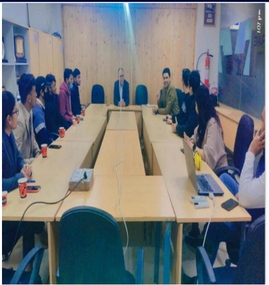
Figure: Presence of Our Students at events