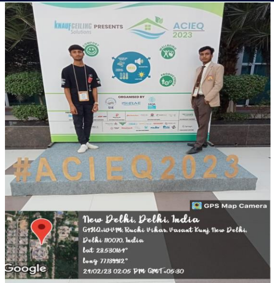
Figure: Presence of Our Students at events

Approved by: AICTE Ministry of HRD, Govt. of India, Affiliated to: U.P.B.T.E., Lucknow